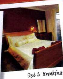
Bed & Breakfasts