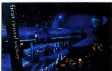
First naval victory